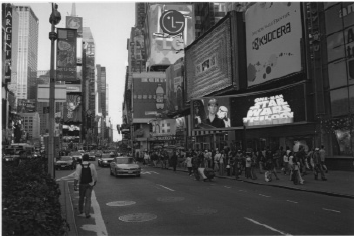
Another One Man Star Wars marquee—New York City (pop. more than 300), 2005.

My short career has already been full of ups and downs. I've appeared on American television shows like the Today Show and Late Night with Conan O'Brien . I do a lot of morning radio shows. DJs often ask me if I'm “the Star Wars guy.” (It's hardly a surprise being eclipsed by arguably the biggest movie