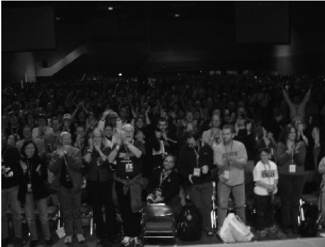
The Lucasfilm "audition." It went very, very well.