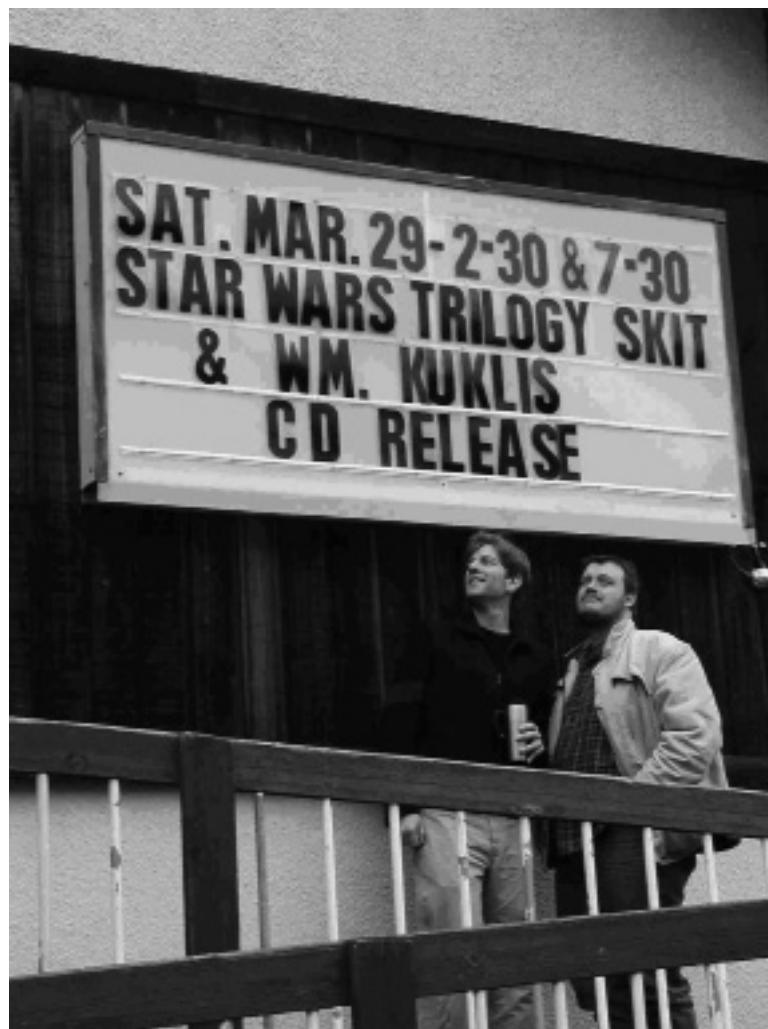
The first One Man Star Wars "skit" marquee, Silverton, BC (pop. 300, maybe), March 2003. Your show being referred to as a "skit" is not quite a solo actor's dream, but a marquee is a marquee, no?

When OMSW came to Toronto's Fringe Festival it did very well. I actually made money. I was crushed that I'd not taken a bigger risk and arranged for a more extensive tour. I actually went back to the mountains in Barkerville,